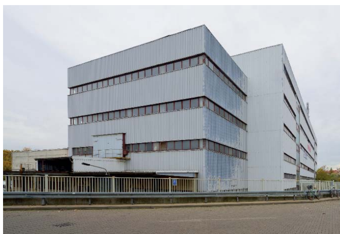
Leipzig, Hornstr. 3 (Gewerbeobjekt)