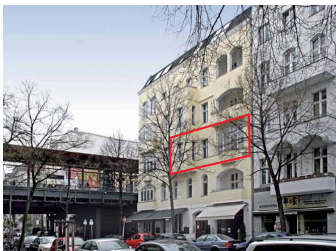
Berlin-Charlottenburg, Bleibtreustr. 7 (Eigentumswohnung)