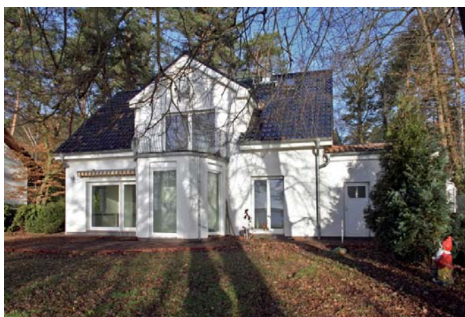
Bad Saarow, Friedrich-Engels-Damm 361 (Einfamilienhaus)