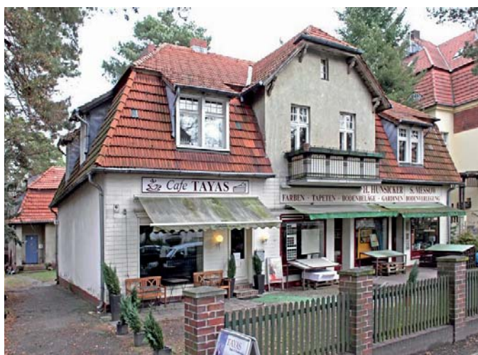
Berlin-Zehlendorf, Prinz-Friedrich-Leopold-Str. 6 (WGH)